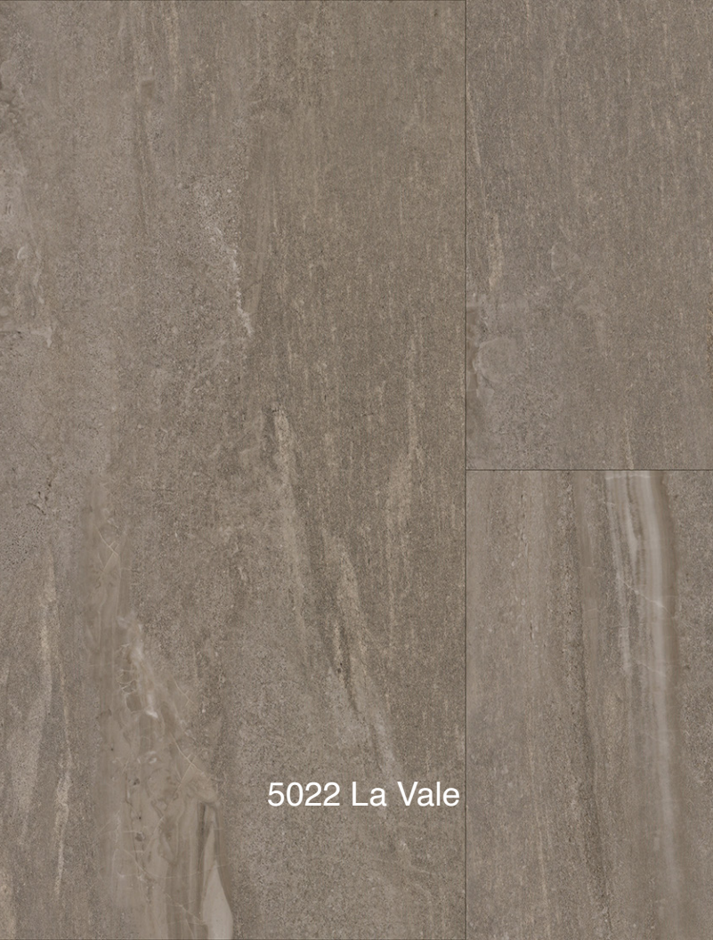
5022 La Vale